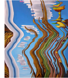
wendy deschene canada intermedia interventionist www.wendydeschene.com