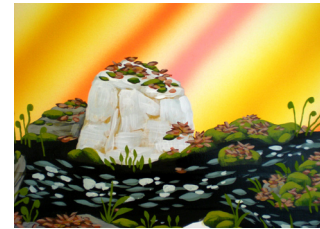
amy chan virginia painter www.amychan.org