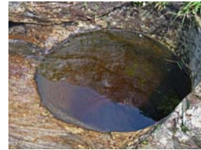
diane barcelo connecticut sculptor/installation artist

open studios june 2009 sunday, july 12, 2009 artists-in-residence 2:00 pm