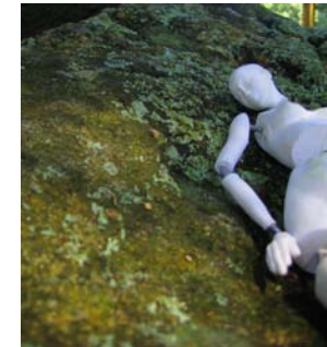
cary baker vermont/new york environmental artist