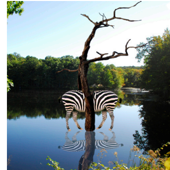
nung-hsin hu taiwan/new york sculptor/installation artist www.nunghsinhu.com