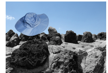
danielle adair california video/installation/text www.danielleadair.com