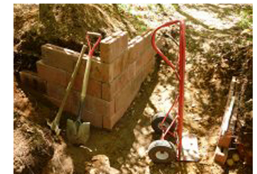
jun'ichiro ishii japan/france site-specific installation/video www.reart.net