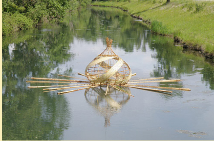
French artist François Fréchet, Stellaria viminalis , Villeneuve lez Avignon, France

For a stimulating presentation of the vision for Thanatopolis by a distinguished inter-disciplinary panel and a preview of the October 2 Thanatopolis Exhibition, you are cordially invited to attend the closing session of the Thanatopolis Symposium at I-Park on Sunday, July 25 from 2:30 until approximately 4:30.