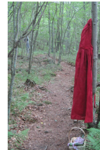
alice momm new york