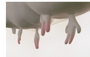
sujin lim south korea