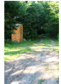
ji eun kim south korea