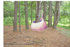
françois fréchet france