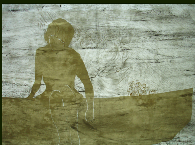
Holly Ewald Rhode Island Collage, Drawing hollyewald.com