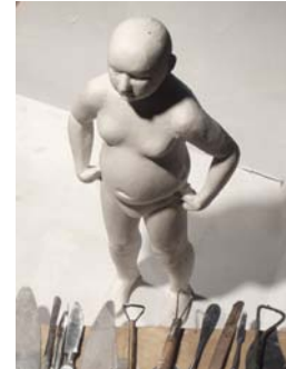
Ivars Drulle Latvia Sculpture/Sound www.ivarsdrulle.com