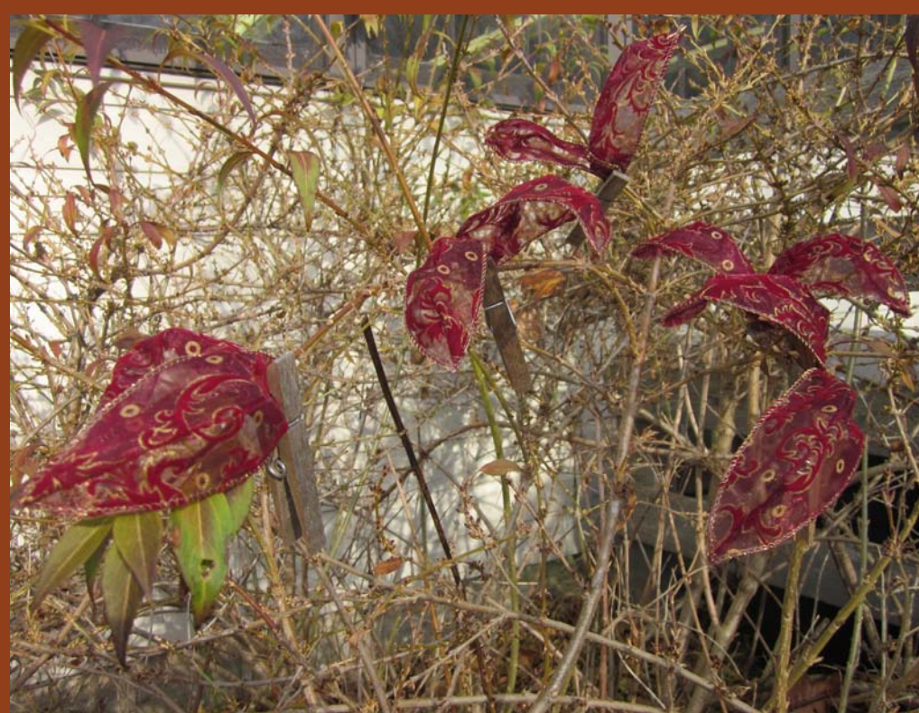
Rachel Stevens New Mexico Sculpture/Installation Art www.zanebennettgallery.com/index.htm

The program begins at 2:00 p.m. with open studio visits. Semi-formal presentations will begin at 3:00 p.m. Please wear comfortable walking shoes.